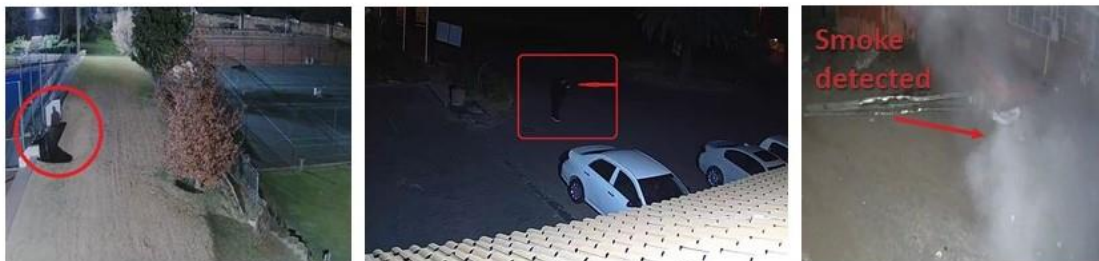
Examples of 24/7 Smart Surveillance detections. Sites are monitored 24 hours a day by the 24/7 Command Centre.

24-7 Security Services has joined forces with Dahua to provide a solution that effectively manages human flow control in the retail, commercial and educational sectors. This solution enables clients to operate and trade while adhering to COVID-19 protocols.