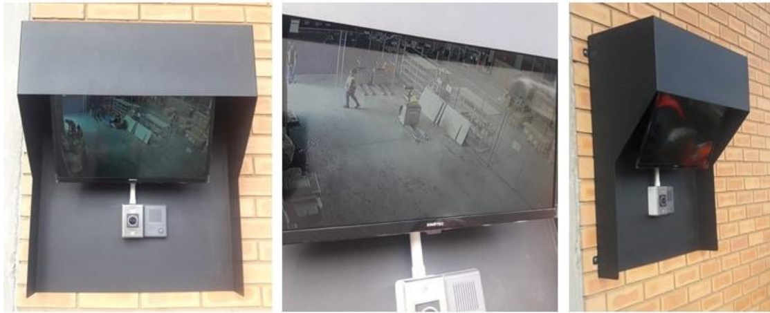
Customised contactless access and monitoring system using 24/7 Smart Surveillance technology.