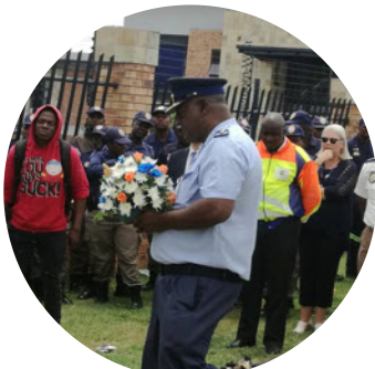
Brig Moodley laying a wreath